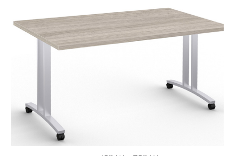
48" W - 72" W